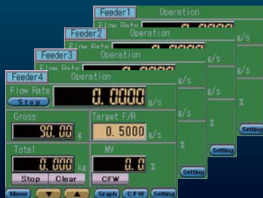
Feeders 1 – 4 operation screens