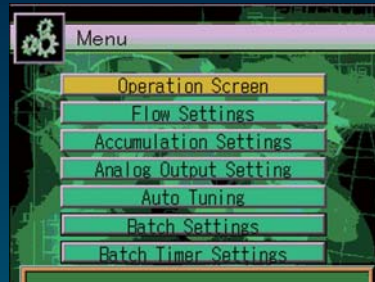
Batch feeding control mode menu screen