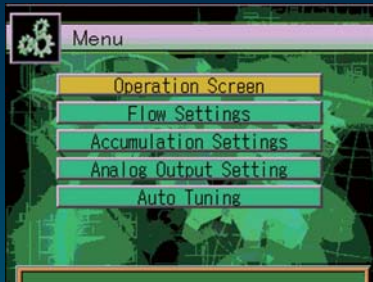
Continuous feeding control mode menu screen