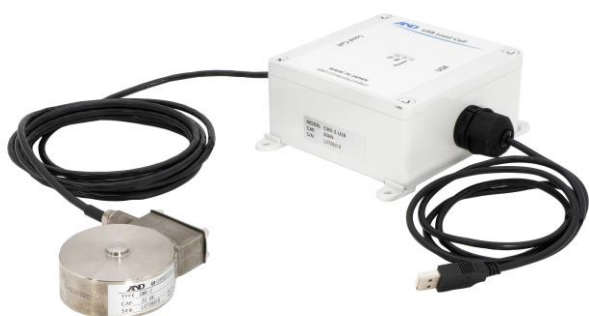
External View CONVERSION BOX